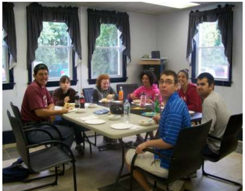
Above: Next Step enjoyed cooking grilled cheese and tomato soup together for a group lunch !