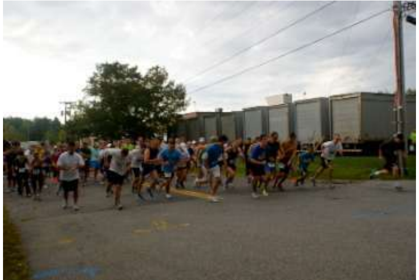
Above: STRIVE for FIVE: Foden Road 5K runners and walkers take off at the start line!