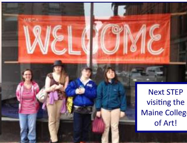
Next STEP visiting the Maine College of Art!