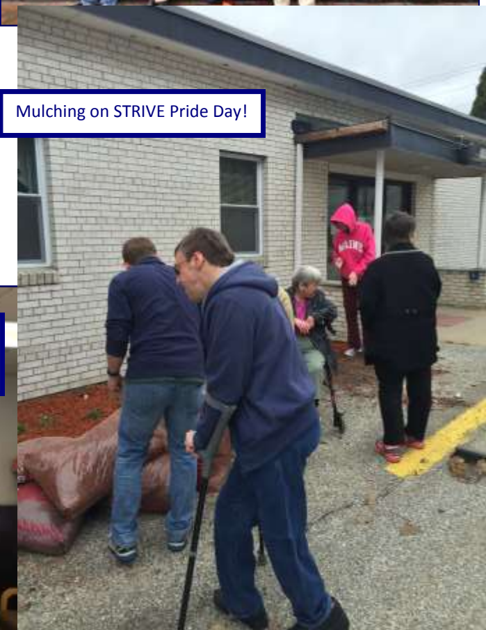
Mulching on STRIVE Pride Day!