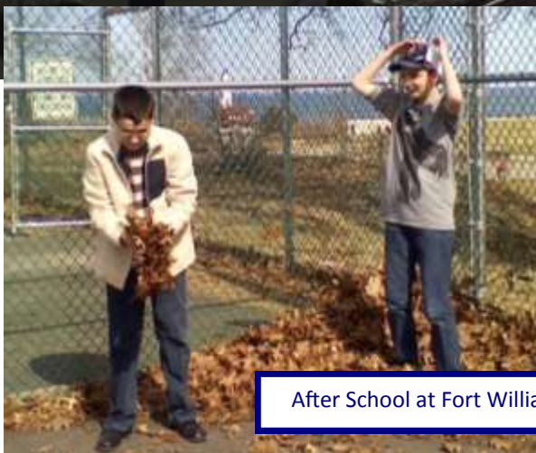
After School at Fort Williams