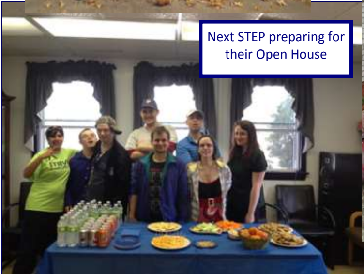
Next STEP preparing for their Open House

If you have photos that you would like to contribute and see in the STRIVE monthly newsletter or on the STRIVE Facebook page, please email them to us at info@pslstrive.org !