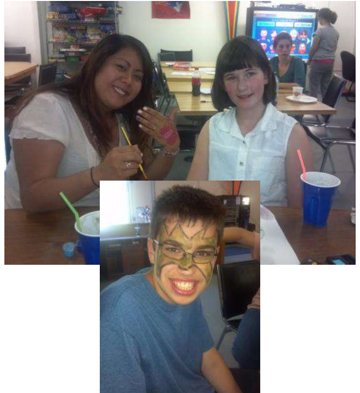
Face Painting at TWEENS!