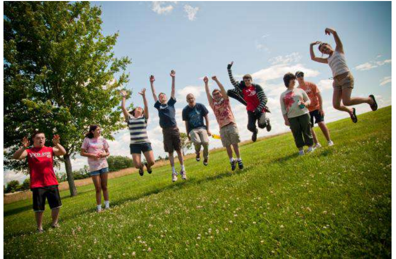
Camp STRIVE having fun at Pineland Farm!