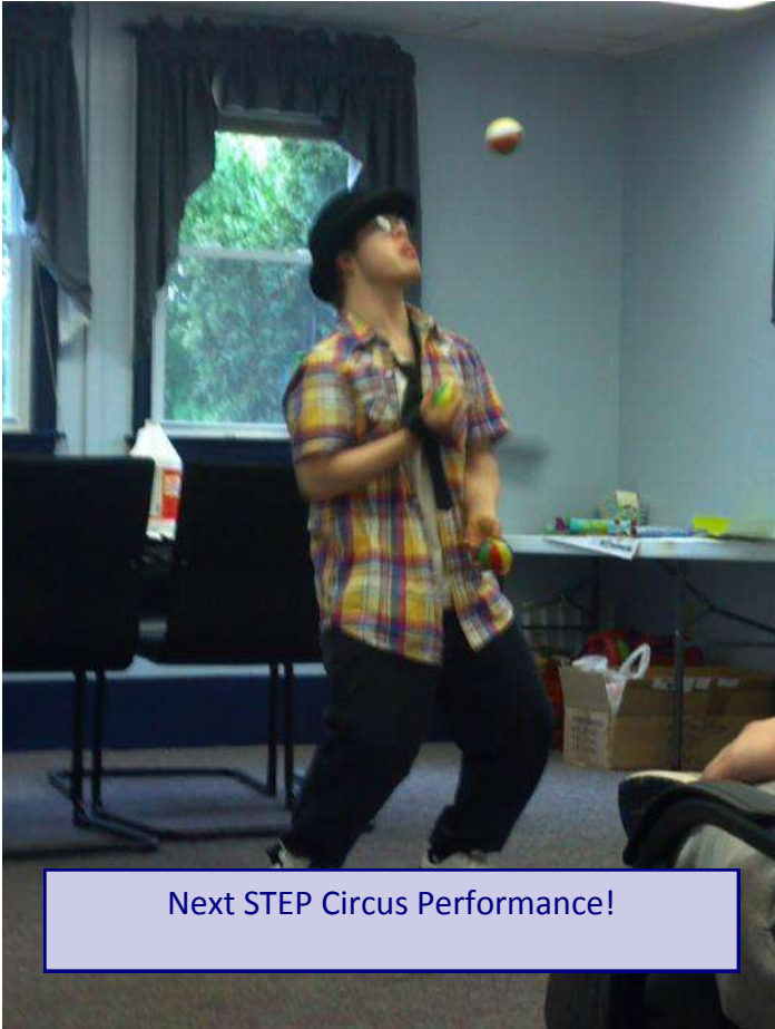
Next STEP Circus Performance!