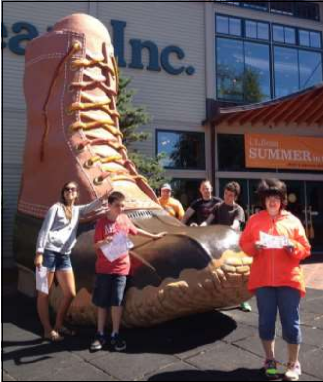
Camp STRIVE at LL Bean for a Scavenger Hunt