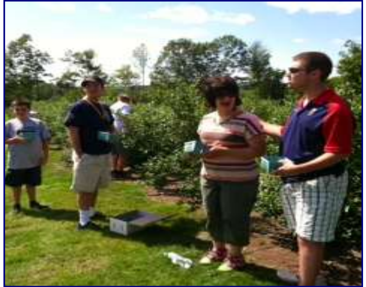
Camp STRIVE Blueberry Picking!