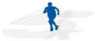
STRIVE for 5* Foden Road 5K

Event: Foden Road 5K & Block Party Date: September 14 th Time: Varying 7am– 12pm Jobs: Course Set Up, Registration, Water stops, Flaggers, Clean Up Crew & more If you are interested email at KSmalley@pslservices.org if interested!