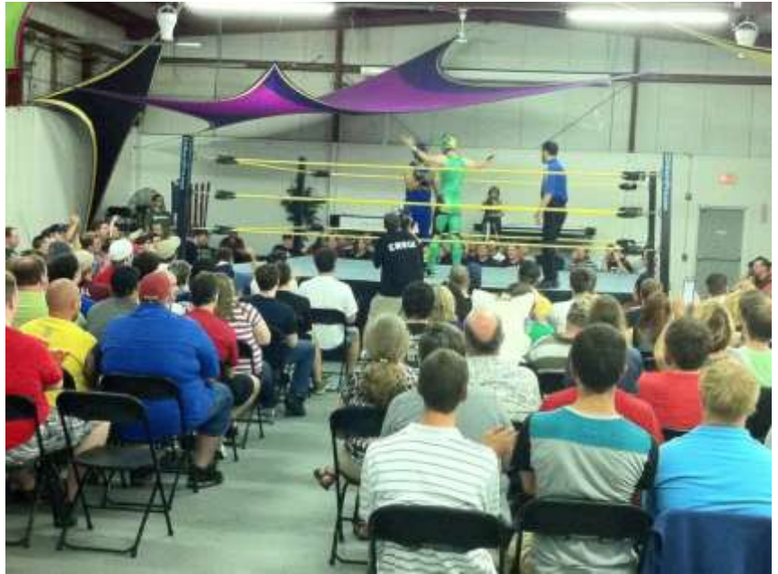
Did you know that STRIVE hosted a Chicara Wrestling Show?