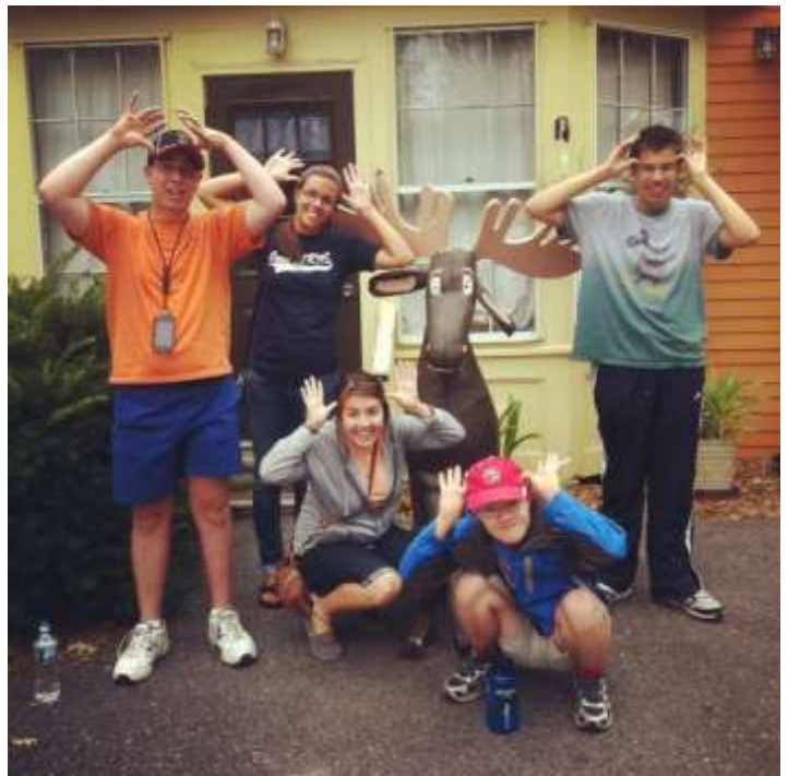
Camp STRIVE having fun!