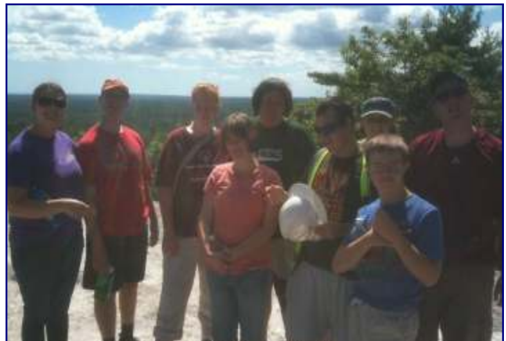
Camp STRIVE climbed a mountain! What did you do?