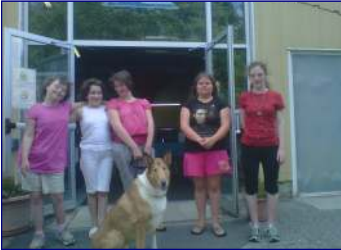
TWEENS learned how to appropriately approach a dog with Good Dogz Training