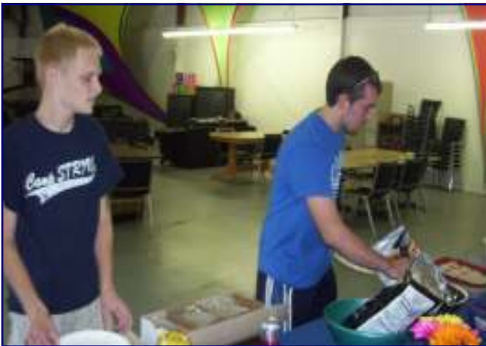
STRIVE Members at the Back to School BBQ