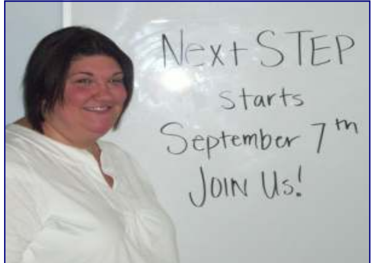
Join Meghan as she starts the STRIVE Next STEP Program