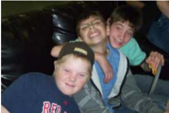
Some tweens enjoying STRIVE Idol!