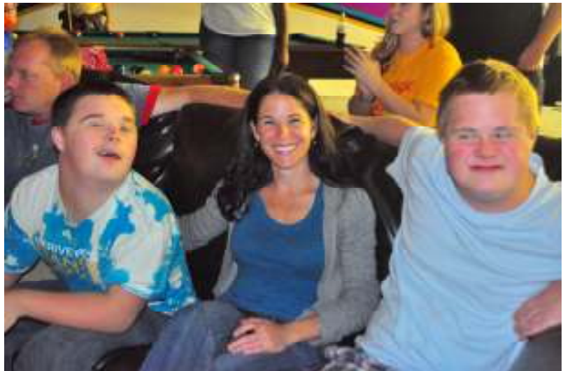
Watching the performances at STRIVE Idol!