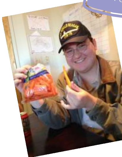
Fun at Bayside!