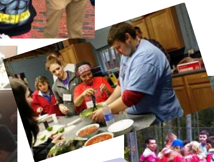
STRIVE Post-Secondary Experience Weekend