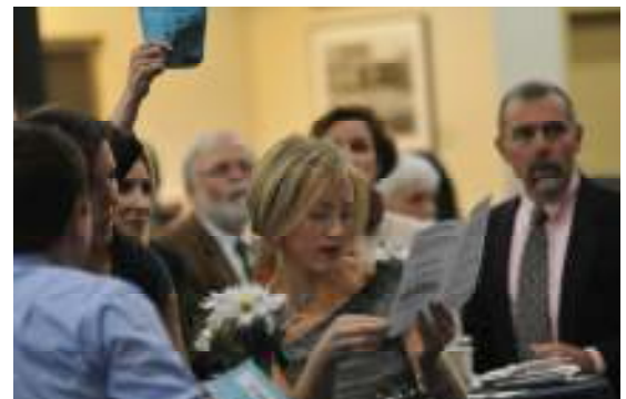
Guests reviewing auction items