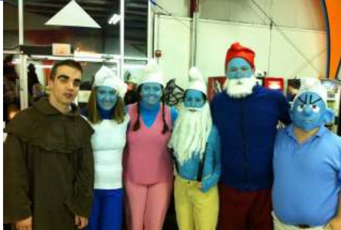
Hallow-Tweens and Halloween STRIVE Night Pictures!