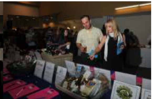
Guests exploring the many great auction items