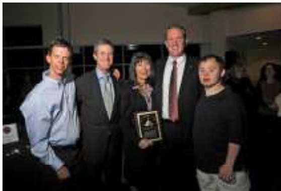
STRIVE giving their Business of the Year award to the Iberdrola USA Foundation