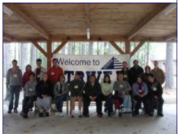
STRIVE U Experience participants pose for a photo at the beginning of the weekend

Look for more information about our next STRIVE U Experience-coming in September 2010!!