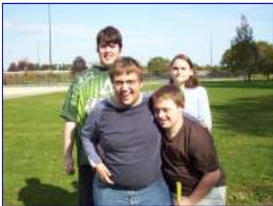
The After-School Program spent the afternoon playing sports at Deering Oaks.