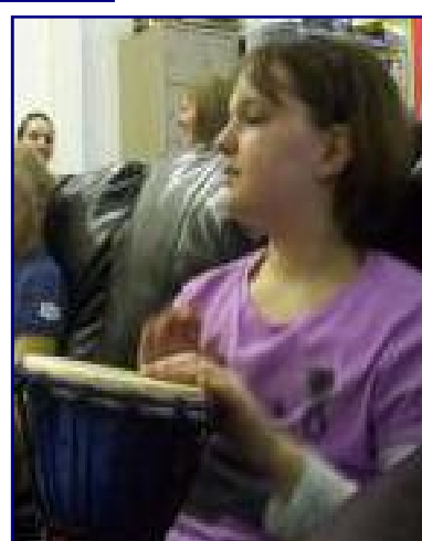
Chelsea rocking the Bongo Drum