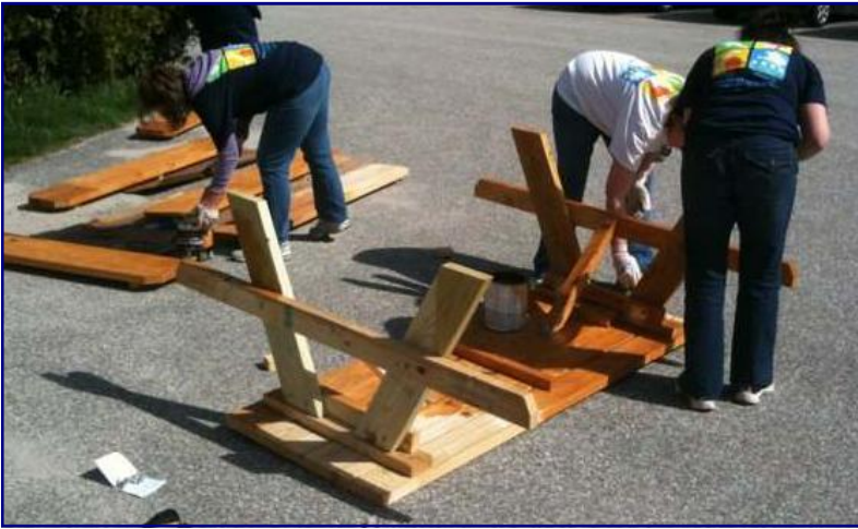
A Group of Anthem Volunteers Constructed & Stained Five Picnic Tables!