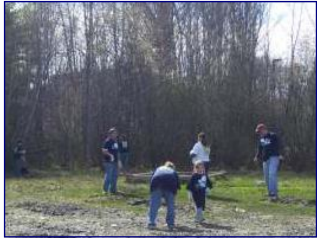
More Anthem Volunteers Planting Raised Vegetable Gardens & Seeding