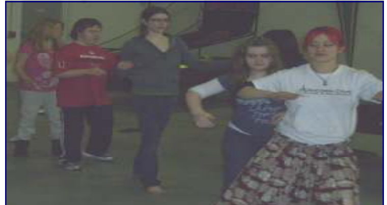
Thank you to Unicorn Cove to teaching us the ancient art of Hula