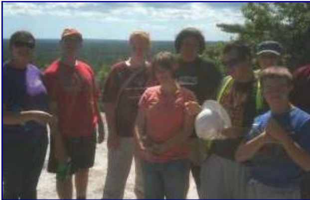
Don't Delay Sign Up for Camp STRIVE today!