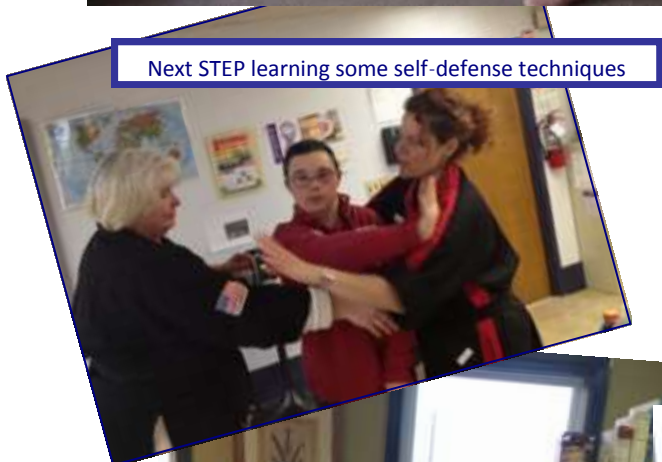
Next STEP learning some self-defense techniques