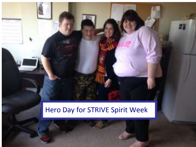
Hero Day for STRIVE Spirit Week