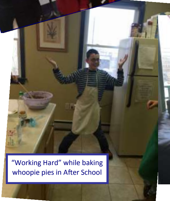
"Working Hard" while baking whoopie pies in After School