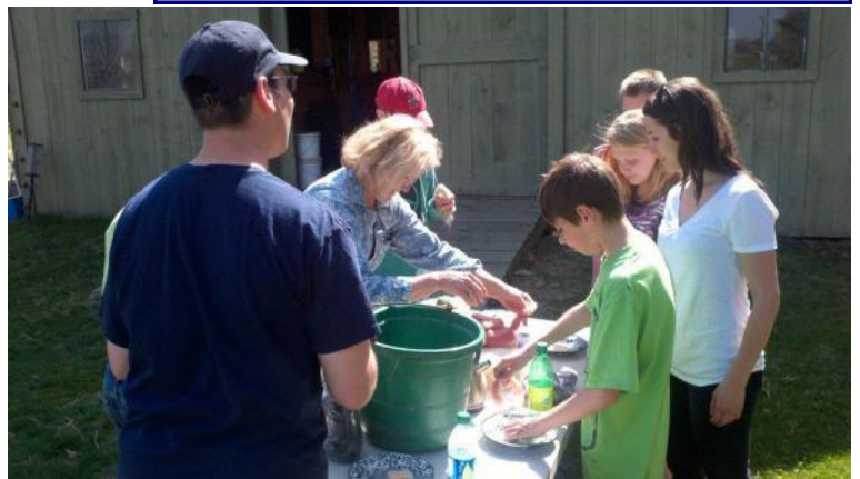
Camp STRIVE at the Longwoods Alpaca Farm in April!