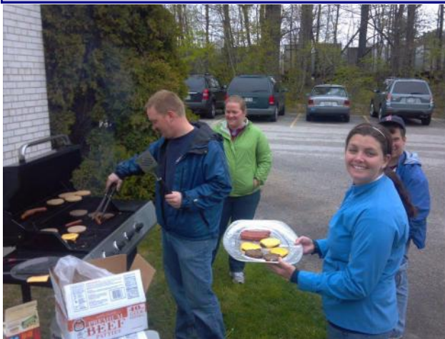
STRIVE Pride Day BBQ! Thank you to all the PSL/STRIVE Staff & Participants who helped clean!