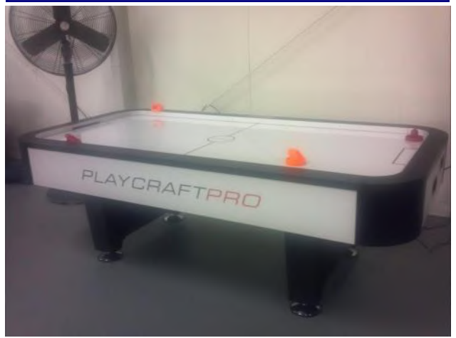
Thank you to UPS who gave us a grant to buy new items for our STRIVE Center! New air hockey table!