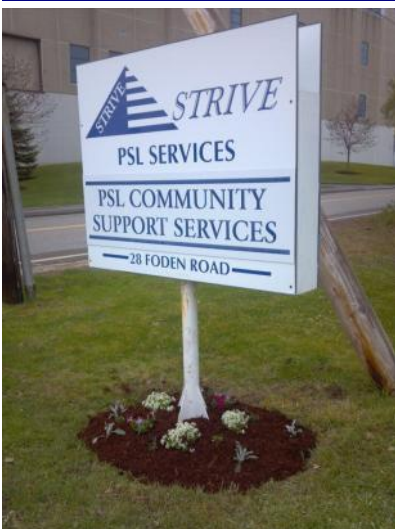
New flowers planted around the Foden Road STRIVE sign!