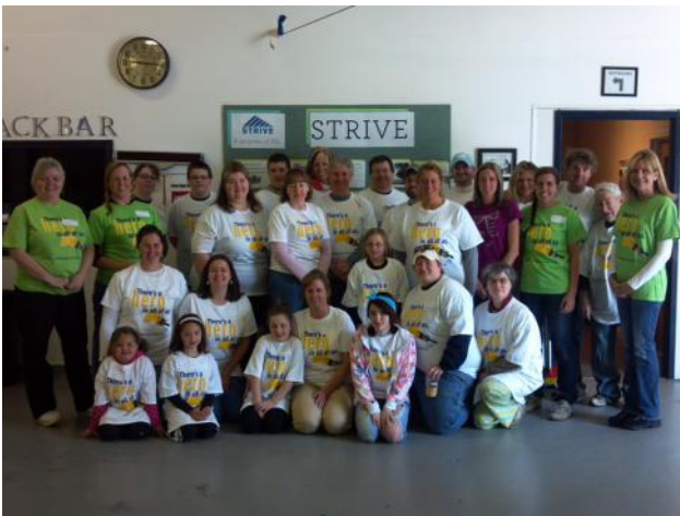
A Huge Thank You to Anthem & all the volunteers who helped clean up the STRIVE Center!