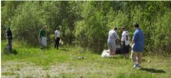
Volunteers picked up trash behind the STRIVE building.

On May 4 th , members of the STRIVE community participated in STRIVE PRIDE Day. Volunteers spent the morning cleaning, planting flowers, and picking up trash outside STRIVE and the afternoon enjoying a delicious BBQ lunch!!