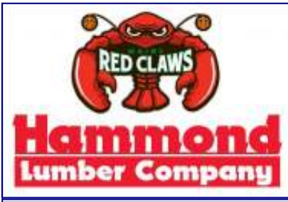
The Maine Red Claws & Hammond Lumber Company, Businesses of the Year