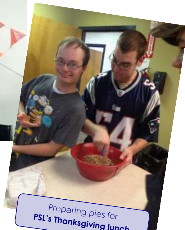
Preparing pies for PSL's Thanksgiving lunch