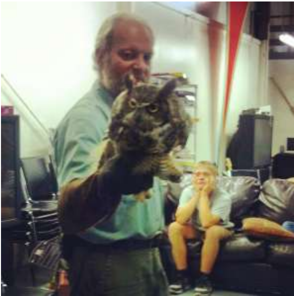
Spark's Ark brought many animal friends including an owl!