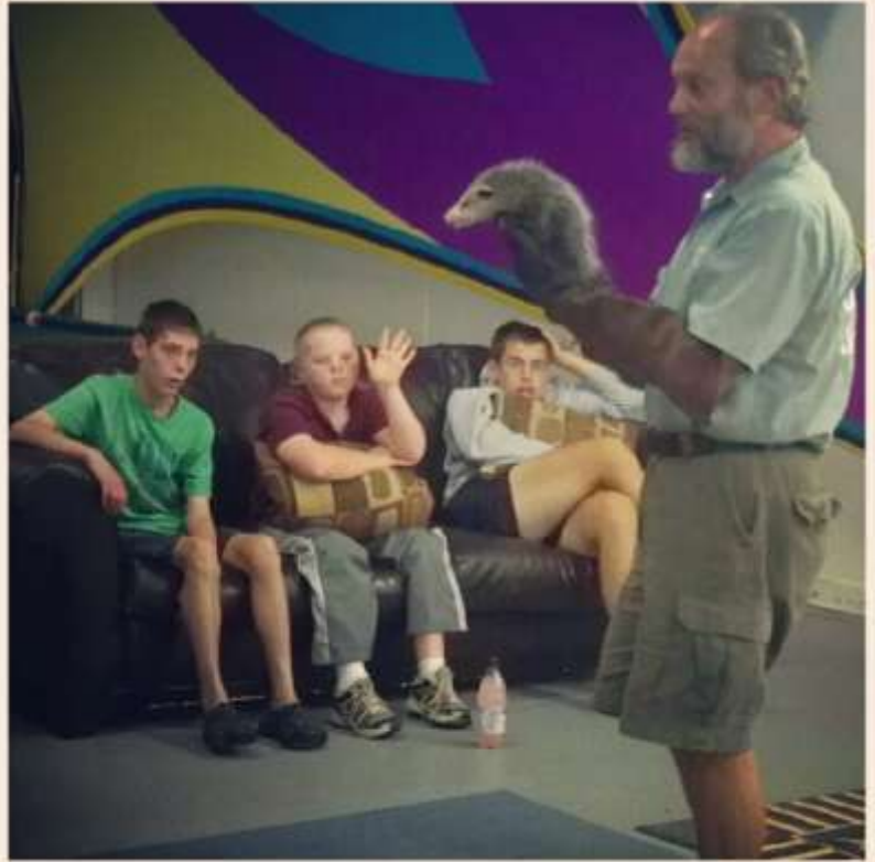
Spark's Ark telling TWEENS all about opossums!