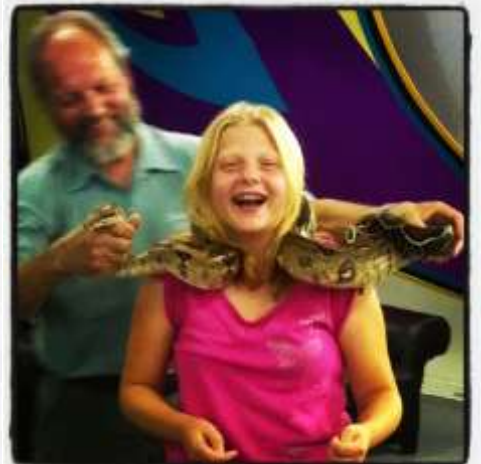
Brave TWEENS take a turn holding a snake!