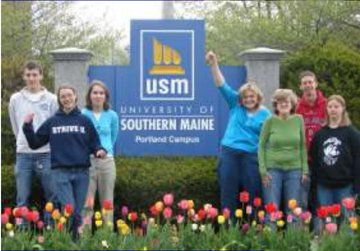
STRIVE U 2011 Graduates