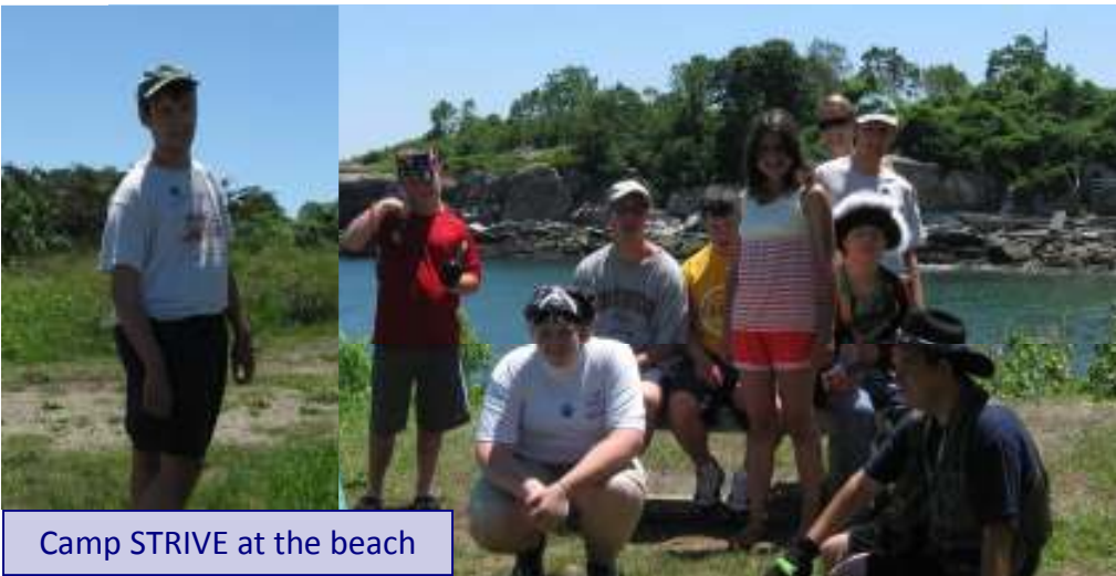
Camp STRIVE at the beach