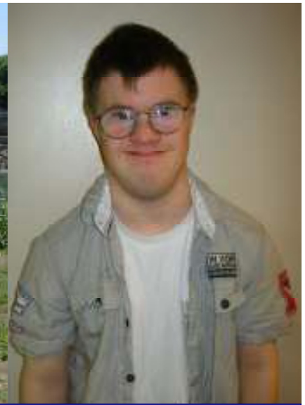
Enjoying a day with Next Step