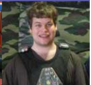
Camp STRIVE at Summit Adventures and Next Step in Portland