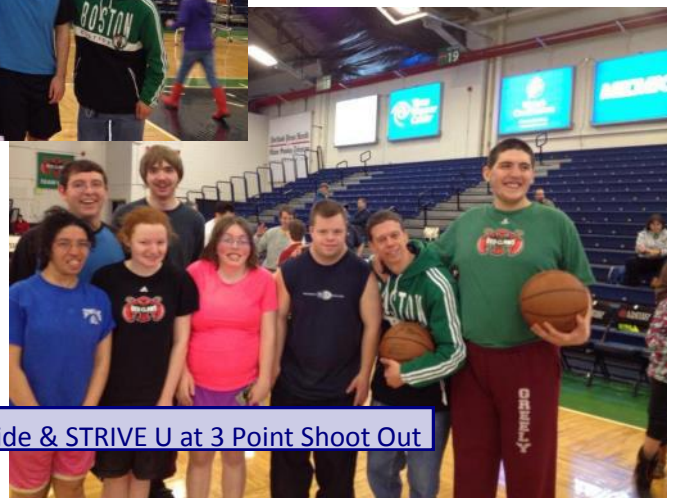
Team Bayside & STRIVE U at 3 Point Shoot Out