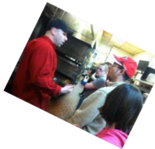
Learning about jobs and making pizza at UNOS