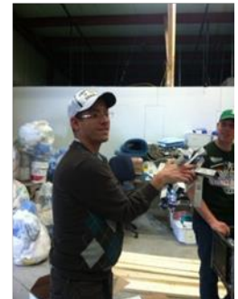
Volunteering at Partners for World Health