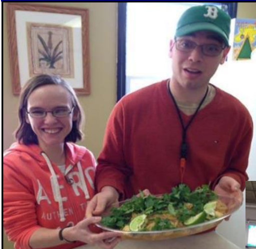
Chicken Pad Thai Anyone? NEXT Step