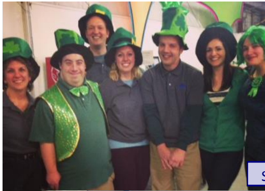
STRIVE Staff dressed for STRIVE Night's Happy St. Patrick's Day Theme!