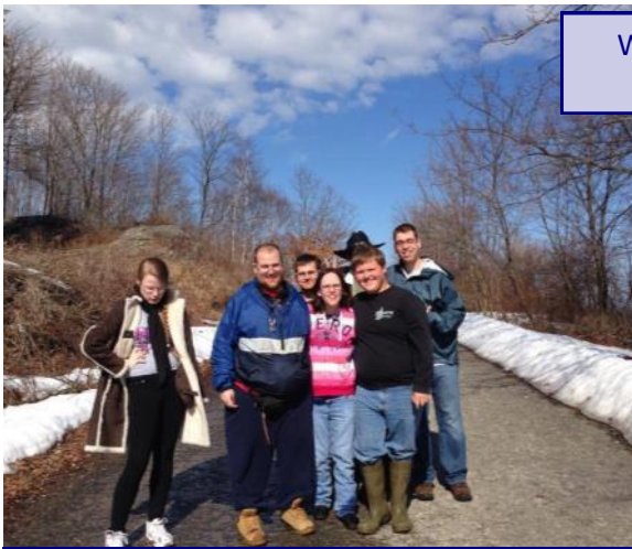
NEXT Step at Fort Williams!

Winning Team: The Blazers at 3 Points for STRIVE at Portland Expo ! Thank you for all of your support!