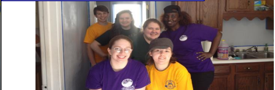
USM's "Husky Day of Service" 6 USM students painted the STRIVE U kitchen, entryway, and bathroom!